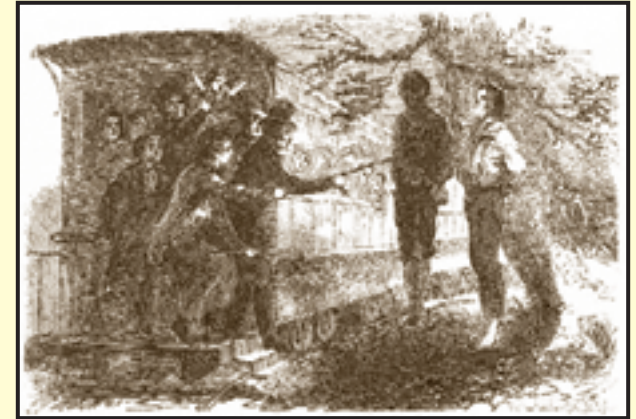
Hangings of Fry and Hinshaw, from Parson Brownlow's Book , 1862

Hinshaw, with “hands bound behind them,” marched up Depot Street “in a hollow square of soldiers.” They walked across the railroad tracks near the depot and then “up a gently sloping hill to the edge of the woods where two ropes were dangling from a hung