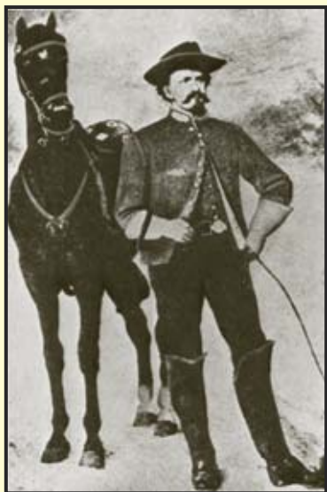
Gen. John Hunt Morgan and Black Bess

The death of Morgan was a blow to the morale of Confederates in East Tennessee and throughout the South.